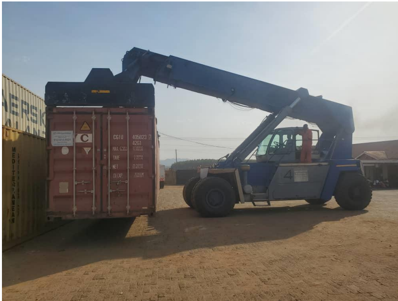
Crane off loads BFM container at malaba