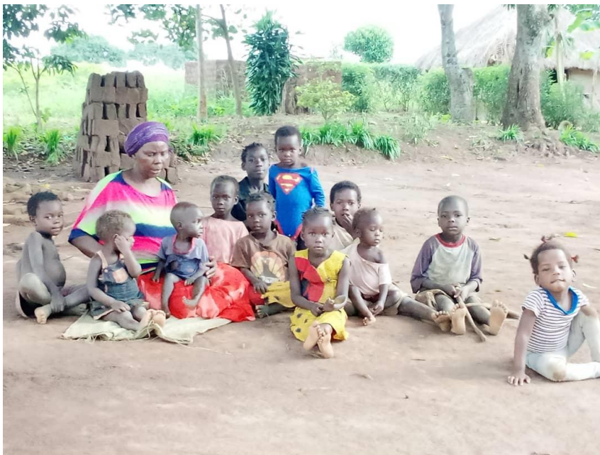
MOTHER GETS CHILDREN FOR SHARING GODS WORD