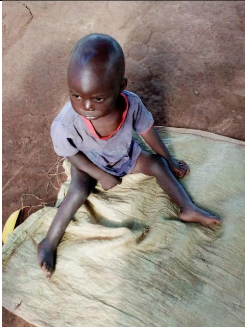
SOME FAMILIES HAVE SUCH CHILDREN-PRAY FOR THEM