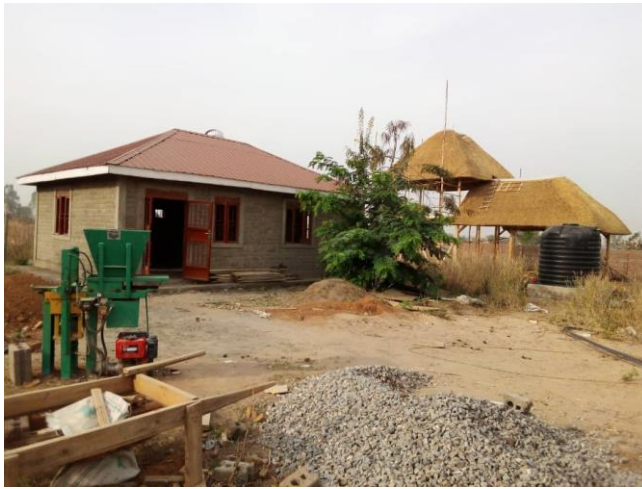
RESIDENSITIAL : BAXTER ( ADJUMAN)