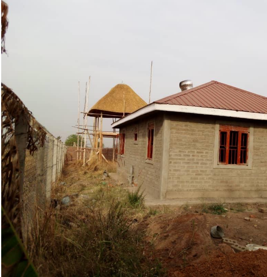
MORE CONSTRUCTION -at site