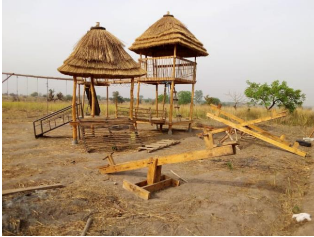
PLAY SITE-ADJUMAN (FOR YOUTH)